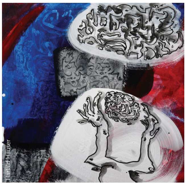
One of the works from "The Self Explorer" series by Harald Häuser