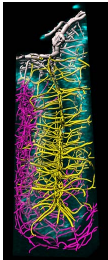
Blood Vessels : 3D reconstruction of blood vessels in the cerebellum of a mouse.